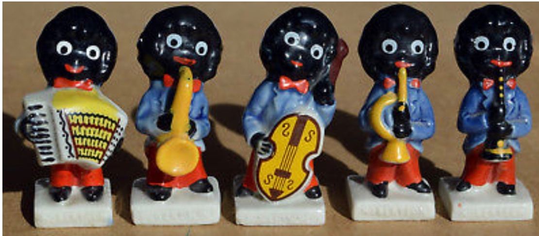
Close up showing EYE detail of genuine Wade Figurines: (transfer applied)

For future reference, the genuine Wade figures should look like this. Note the details of the transfers on the bass and accordion [on the fake double bass player's instrument, the "S" holes aren't mirror images as they would be on a real instrument and as they are on the genuine Wade item] and how the eyes look and their method of application – transfers not hand painted: