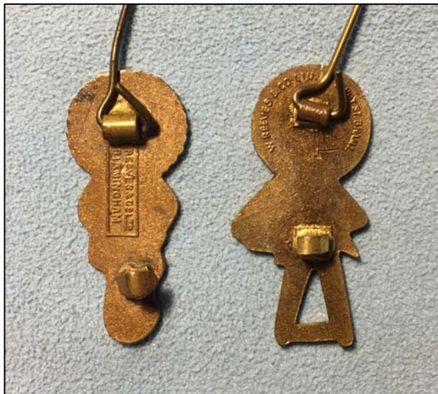
Both produced using the usual brass base metal