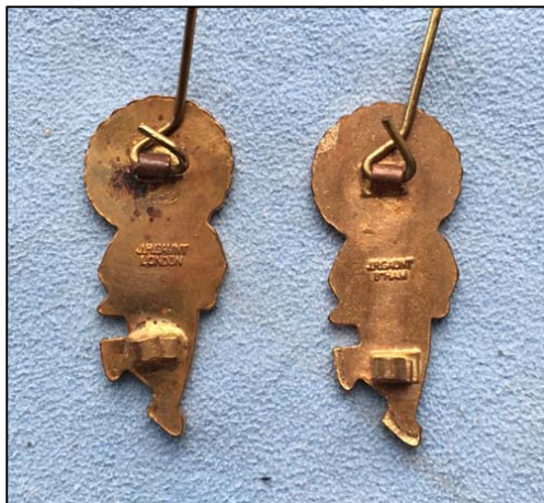
London and B'HAM both small