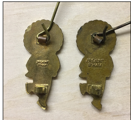
B'HAM small and large