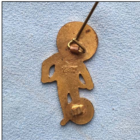
SMALL with white ball