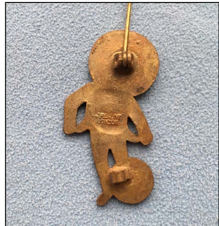
SMALL with blue and white ball